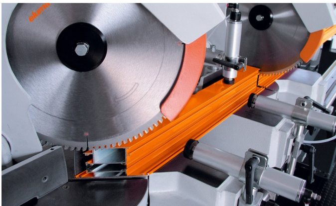
Double mitre saw DG 79