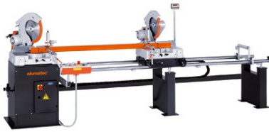
Double mitre saw DG 79