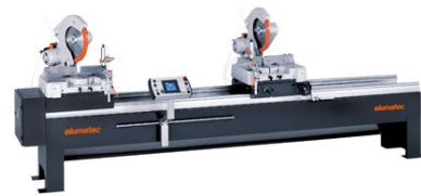
Double mitre saw DG 79 M